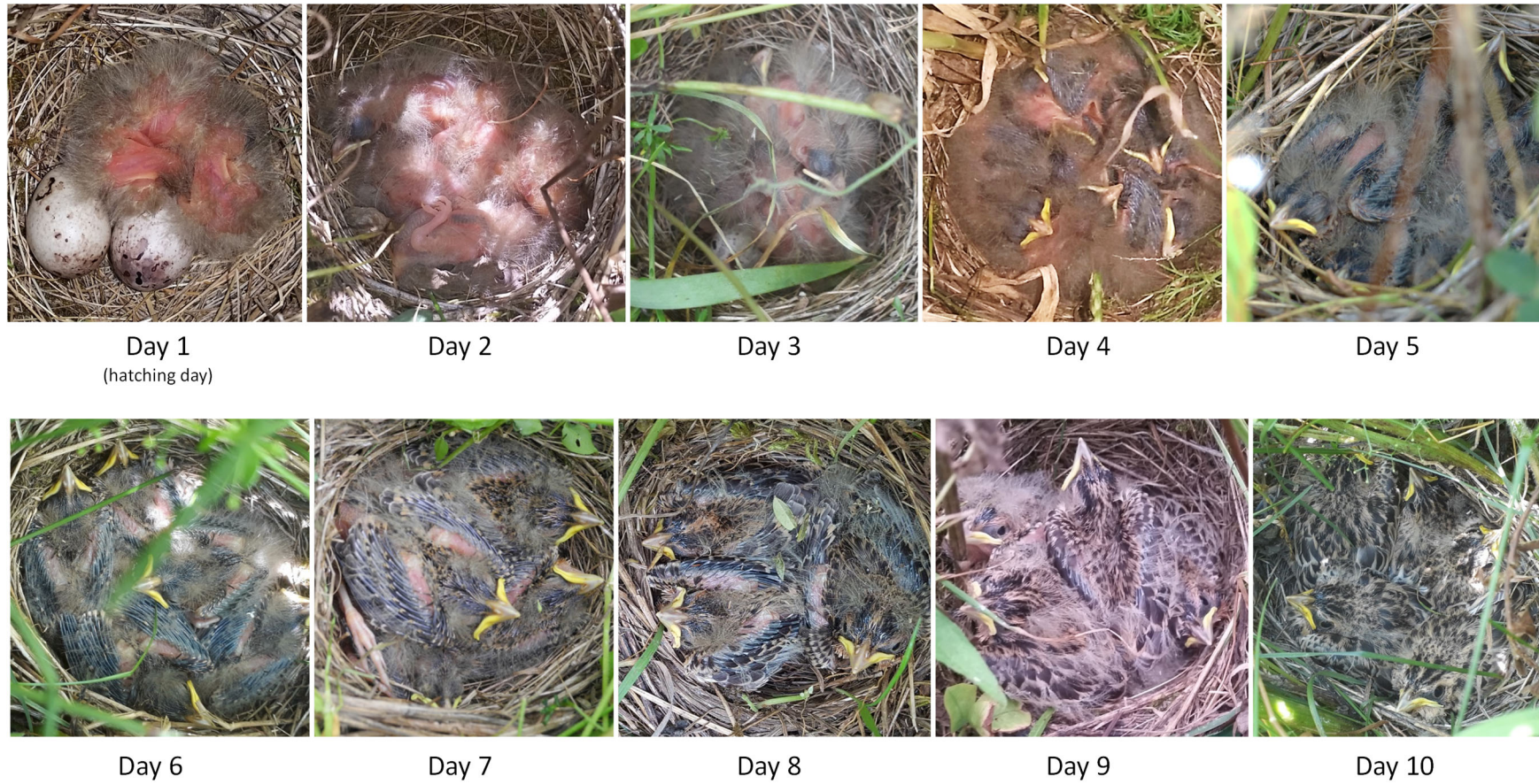
Figure S2. Calibrated pictures of Corn Bunting nestlings of known age post-hatching.