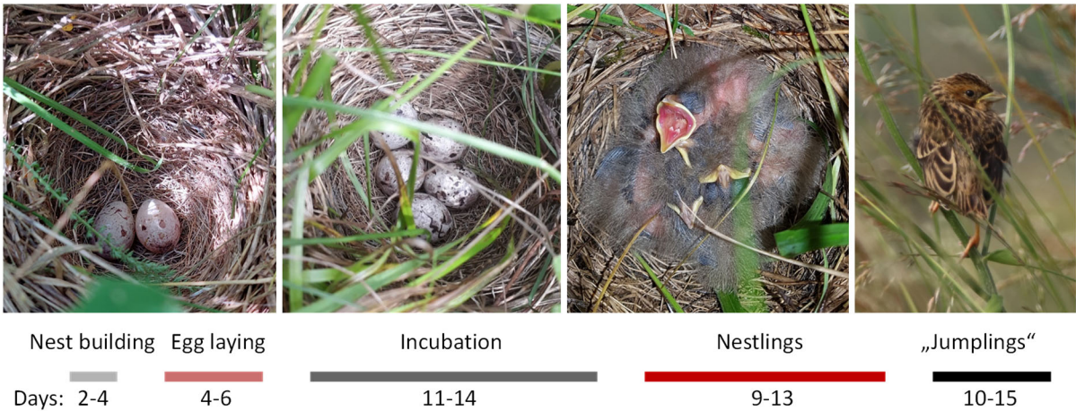
Figure S3. Corn Bunting breeding phases and their estimated duration. Image © Nils Anthes & Markus Handschuh.