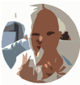
Pictures blurred for anonymity

Helping Project A: You learn that one child living in your area have been diagnosed with Type X cancer in the past week. The infected child have been identified as Hannah (a 2 year old girl). Project A would be able to provide a full dose of the new effective treatment to Hannah for $600,000.