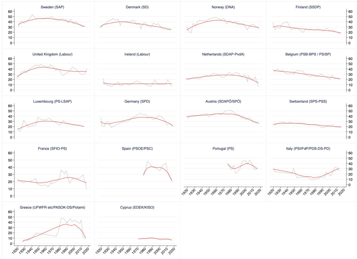
Figure A1: Vote shares of social democratic parties in Western Europe

Note: The lines are estimated by locally weighted scatterplot smoothing.