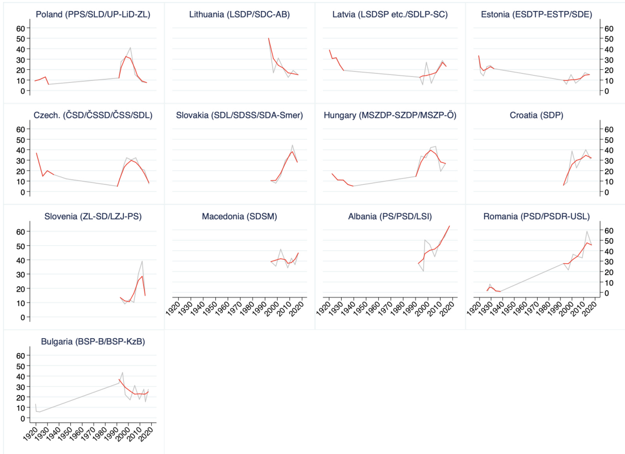
Figure A2: Vote shares of social democratic parties in Eastern Europe

Note: The lines are estimated by locally weighted scatterplot smoothing.