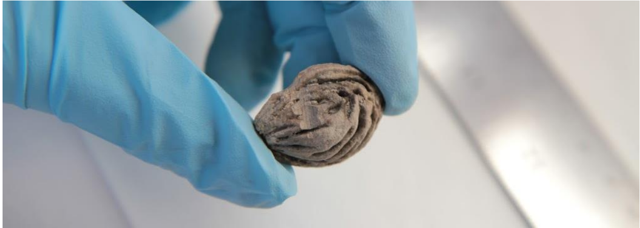
Image: Above: BSM2015 FS -1; Below: BSM2015 FS-2. Showing grooved surface after primary sediment removal