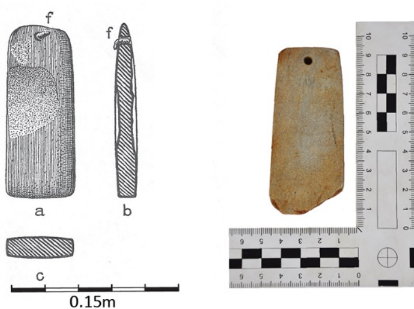
Figure S5. Left) polished stone pendant discovered by Colani (1935) at Ban Soua; right) polished stone pendant discovered at site 1, unit 1; both were discovered beside megalithic jars.