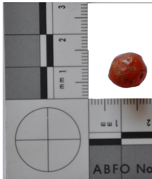
Figure S7. An carnelian bead excavated from unit 1, site 1, Xieng Khouang Laos (credit: Plain of Jars Research Project).