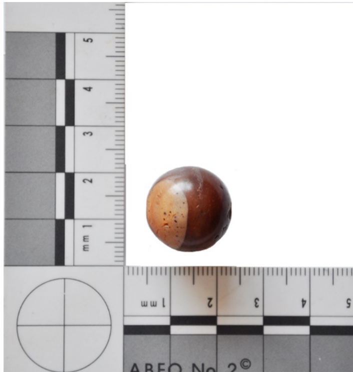
Figure S4. An agate bead excavated from unit 1, site 1, Xieng Khouang Laos.