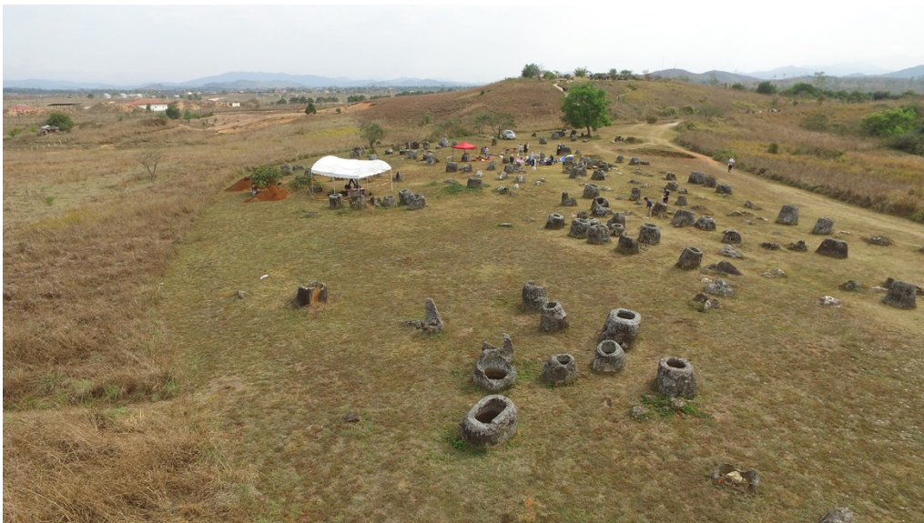
Figure S1. Partial view of site 1 looking to the north-east showing part of jar group 2; excavation units are visible as is jar group 1 on the hill in the background; a bomb crater can also be seen in the rear right.