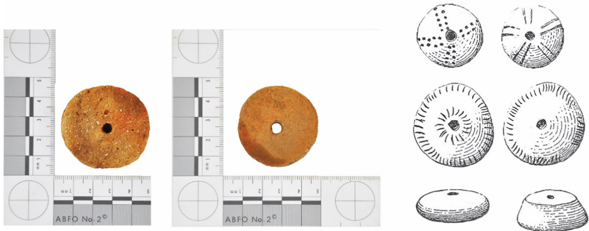
Figure S2. Left) spindle whorls discovered in unit 1, site 1, Xieng Khouang Laos; right) spindle whorls site 1 (Ban Ang) by Colani (1935).