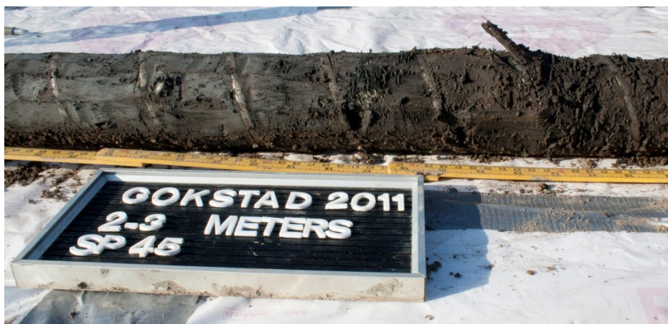
Figure S2. Auger core SP45 from the Gokstad mound. The core shows the bluish grey silty clay to the left, and on the right-hand side there are turf layers. Jutting out between these turf layers is a piece of wood, identified on site as oak.