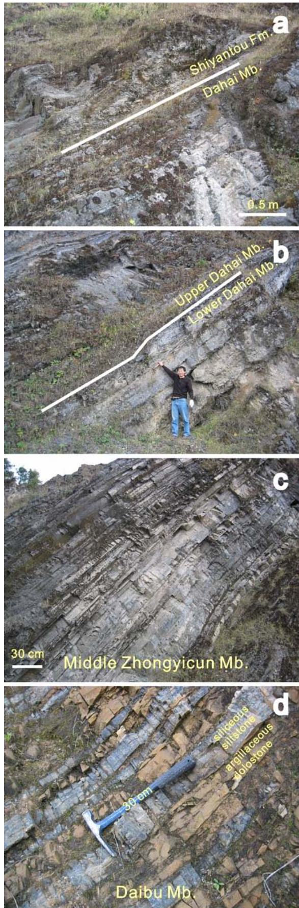
Figure A1. Outcrops of Laolin section in northeastern Yunnan, southwestern China. (a) Siltstone of