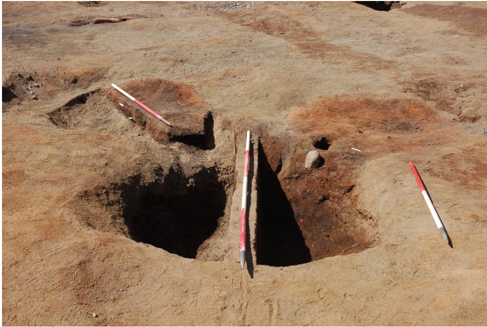
ONLINE FIG. 4. Clay lump and possible lining in fire-pit 404.