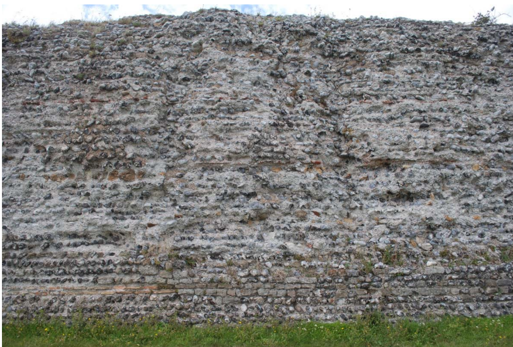
ONLINE FIG. 6. An area of the internal (south) face of the north wall of the fort, showing uneven vertical scarring and changes in facing similar to those on the supposed east interval tower.