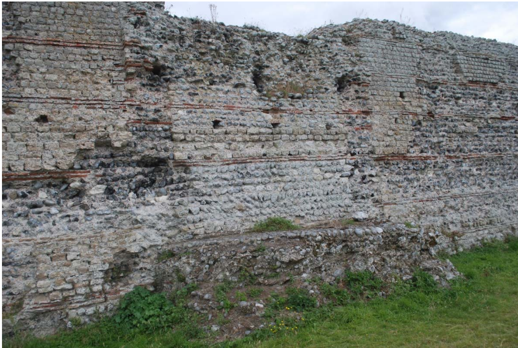
ONLINE FIG. 3. The west tower of the north wall, showing the scars of the robbed side walls and the base of the tower, and the uninterrupted tile courses that show the scars of robbed side walls. Note that the second tile course from the bottom is interrupted within the walls of the tower, where a repair to the wall face has been effected.