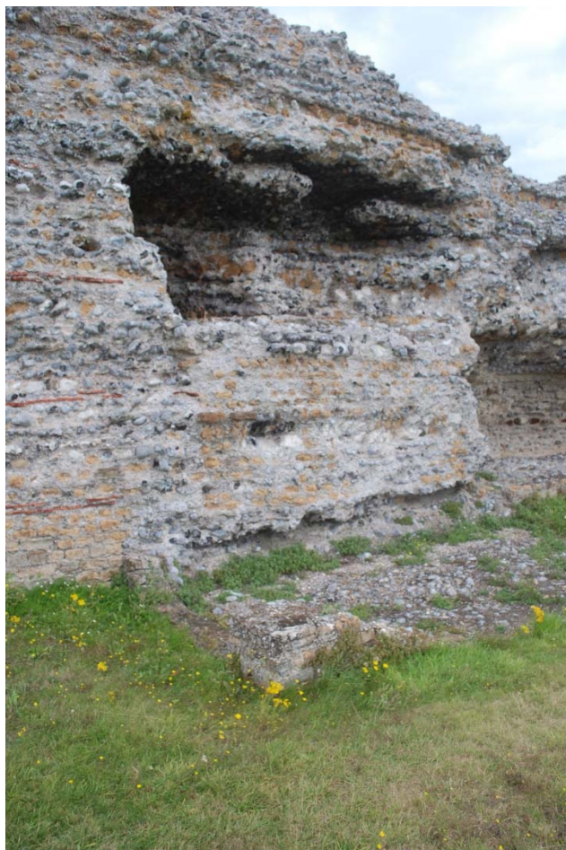
ONLINE FIG. 4. The east tower of the south wall, showing the scars of the robbed side walls, the base of the tower and the interrupted tile courses.