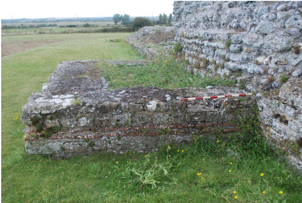
ONLINE FIG. 5. The base of the north tower of the west wall, showing the tile courses carried continuously around the exterior face of the tower.