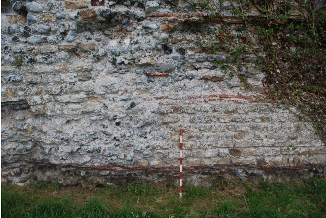
ONLINE FIG. 7. The western edge of the supposed east interval tower. The facing above the bottom tile course is flush, with no sign of a scar from a robbed side wall to a tower.