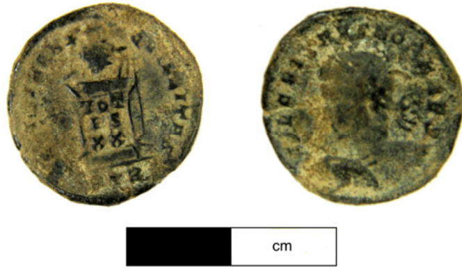
ONLINE FIG. 4. A coin (nummus) of Cripsus, obverse and reverse (Appendix 3, no. 28).