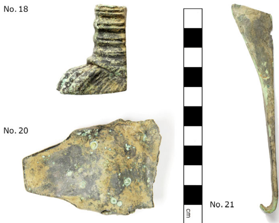
ONLINE FIG. 3. A paw-shaped tripod foot, a piece of a folding pan handle and part of what might be a key or lock (APPENDIX 3, nos 18, 20, 21).