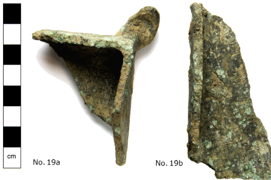
ONLINE FIG. 2. Two parts of a box or stand (APPENDIX 3, no. 19).