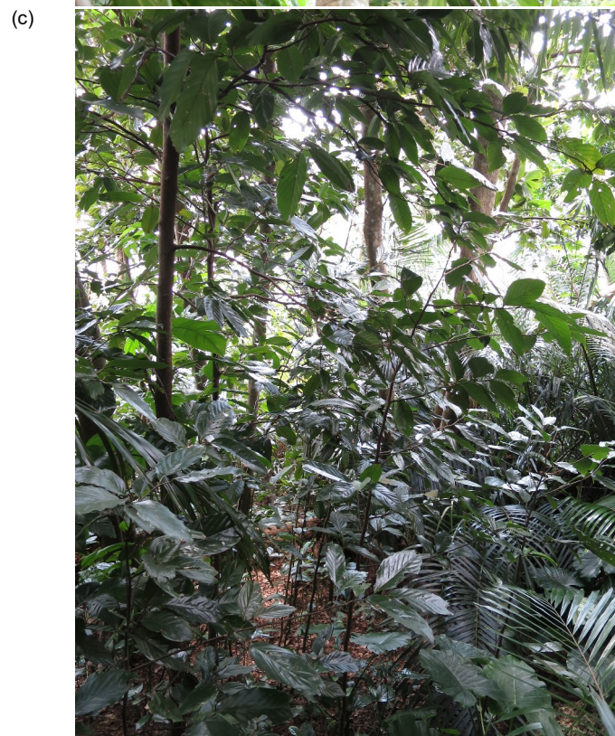
Figure S1. (a) Monoon liukiense (Hatus.) B. Xue et R.M.K. Saunders grows on Iriomote Island, Hateruma Island, and Orchid Island. (b) Ripening fruits, 01 June 2015, (c) seedlings and saplings under the conspecific adults, 10 February 2016, in the habitat on Iriomote Island, Japan.