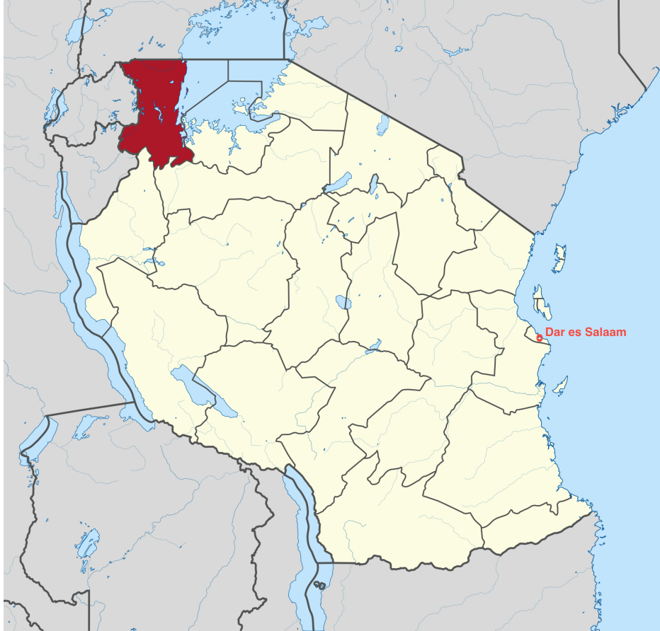
Figure A1. Kagera Region, Tanzania

Kagera region highlighted in red.